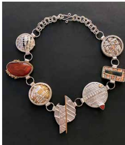
above: Shelly Denes, Squares & Circles Bracelet , sterling silver patinated hand-fabricated bracelet

$371 Members, $411 Guests, $62 Materials Fee