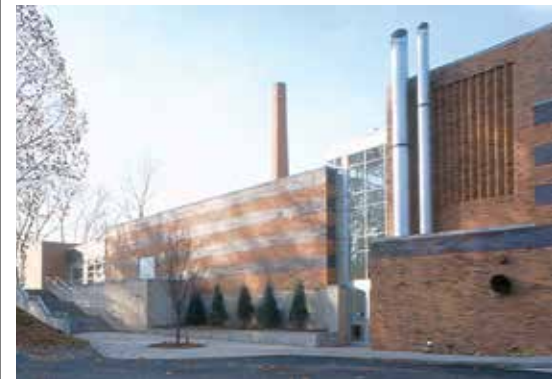
above: BBAC South Facade

No class January 19 (Martin Luther King Jr. Day)