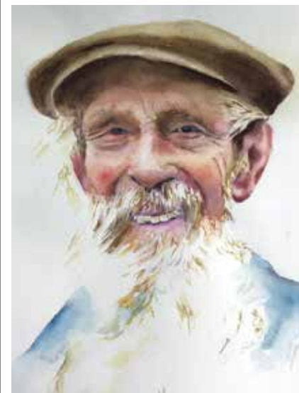
right: Ed Grunert, Eyes of Wonder , watercolor, detail