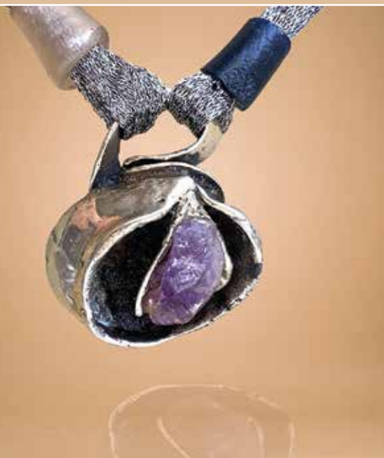
above: Selen Bayrak, Amethyst Cocoon Necklace , detail