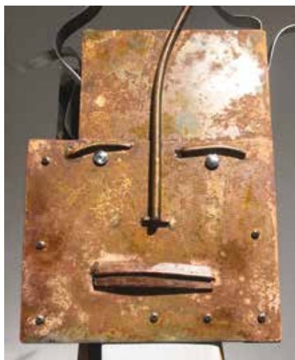
above: Instructor Scott Brazeau, Face , copper, detail

Mondays, September 8 – December 1 3:45 pm – 6:45 pm, 13 sessions $439 Members, $479 Guests, $68 Materials Fee