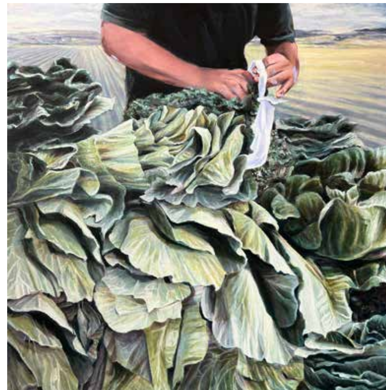
above: Lynn Galbreath, Sustainable Living , oil on Baltic Birch