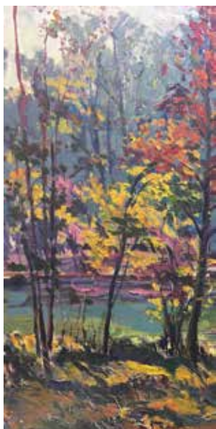
left: Instructor Anatoliy Shapiro, Forest , oil, detail