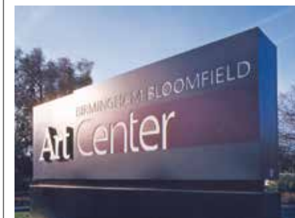
above: BBAC Sign

Fall Exhibition Schedule Inside Back Cover