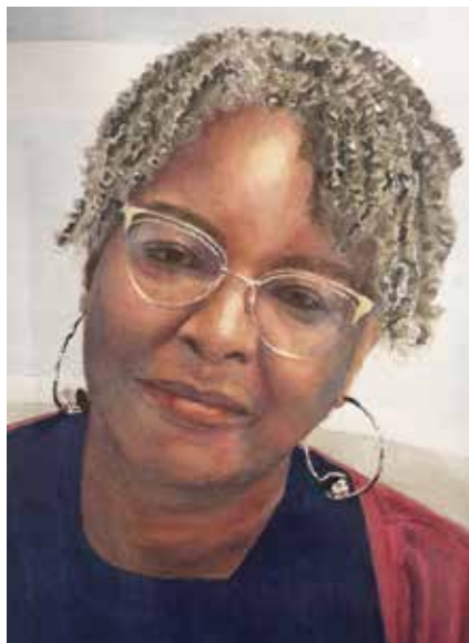
above: Maggie Green, Kirkanne , watercolor on paper, detail