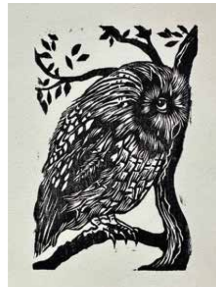
above: Instructor Nobuko Yamasaki, Owl , woodblock print

Wednesdays, September 10 – November 12 10:00 am – 12:00 pm, 10 sessions $225 Members, $265 Guests, $10 Materials Fee