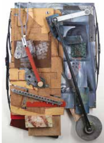
left: Instructor Marat Paransky, Mechanically Separated , mixed media

Fridays, September 12 – December 5 No Class November 28 12:30 pm – 3:30 pm, 12 sessions $405 Members, $445 Guests