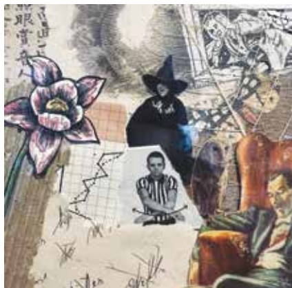
above: Antonia Oakley, Random Dream No 14 , mixed media

Thursdays, April 6 – June 15 7:00 pm – 10:00 pm, 11 sessions $315 Members, $355 Guests