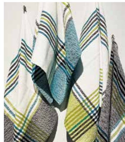
right: Vicki Fox DiLaura, Olive-Teal Kitchen Towels — Set of 4 unmercerized cotton, detail