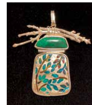
above: Arlene Gorlick, Earth Pendant , silver, champleve enamel, malachite

Saturdays: 4/8, 4/22, 5/6, 5/20, 6/10 9:00 am – 3:00 pm, 5 sessions $287 Members, $327 Guests $65 Materials/Studio Fee