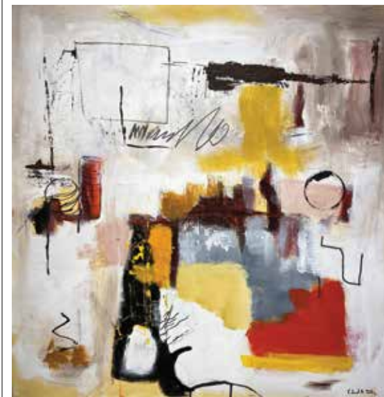
above: Ed Tillery, Focus , acrylic

Wednesdays, April 5 – June 14 9:00 am – 12:00 pm, 11 sessions $315 Members, $355 Guests