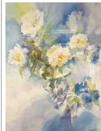
left: Edward Grunert, Beautiful in Blue , watercolor

$229 Members, $269 Guests, $5 Materials Fee