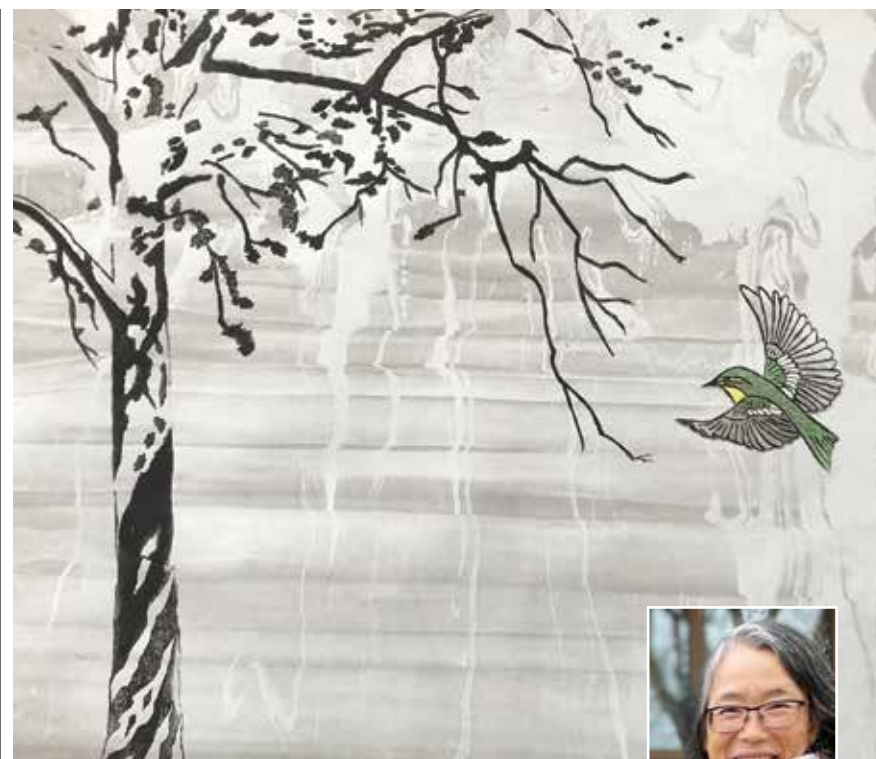
above: Nobuko Yamasaki, Mountain Stream , Ink Dropping, woodblock print, collage