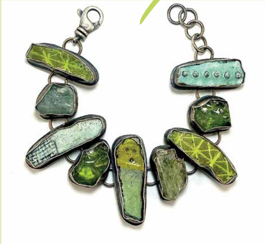
above: Julie Billups, Enameled Steel Polka Dot Bracelet sterling silver links w/ enameled steel & vesuvianite gemstone links