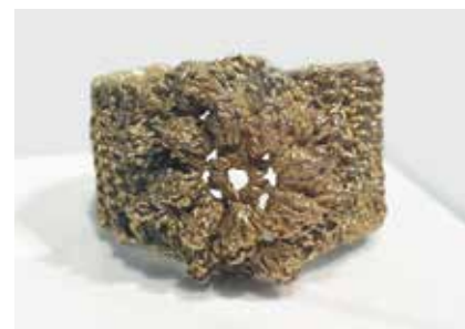
above: Renée DeWitt, Crocheted Cuff , cast bronze

Saturdays: 4/15, 4/29, 5/13, 6/3, 6/17 10:00 am – 4:00 pm, 5 sessions $287 Members, $327 Guests $45 Materials/Studio Fee