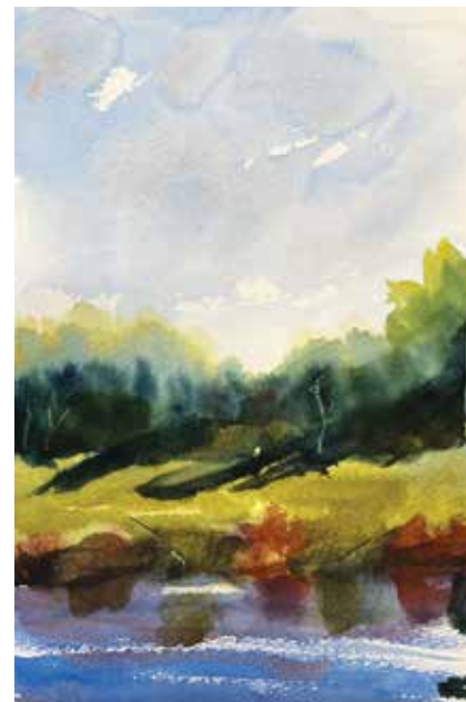
above: Tiffany McCants, Untitled , watercolor

$315 Members, $355 Guests, $10 Materials Fee