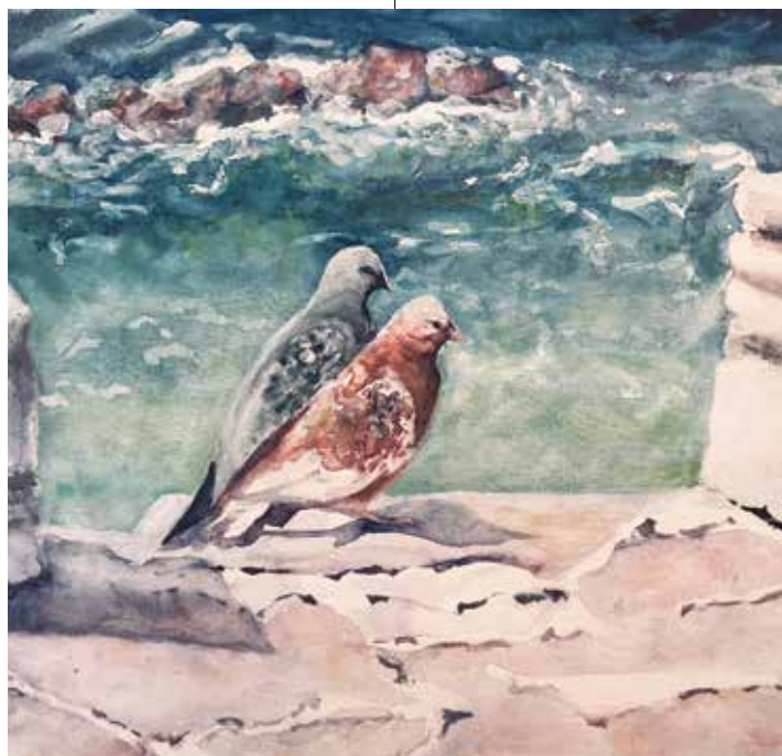
left: Carol Chambers, Bird's Eye View , watercolor, detail

$315 Members, $355 Guests, $5 Materials Fee