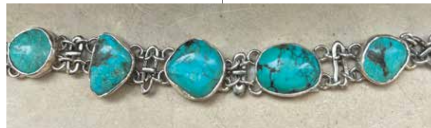
below: Sherry Gershenson, Cracked Eggs Explosion , silver & turquoise