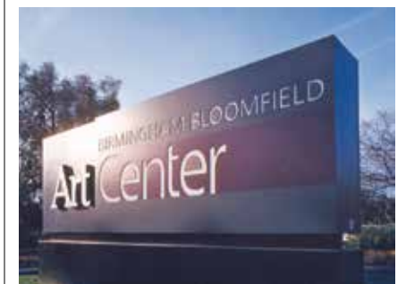
above: BBAC Sign

[ Closed July 3 & 4 — Independence Day Holiday ]