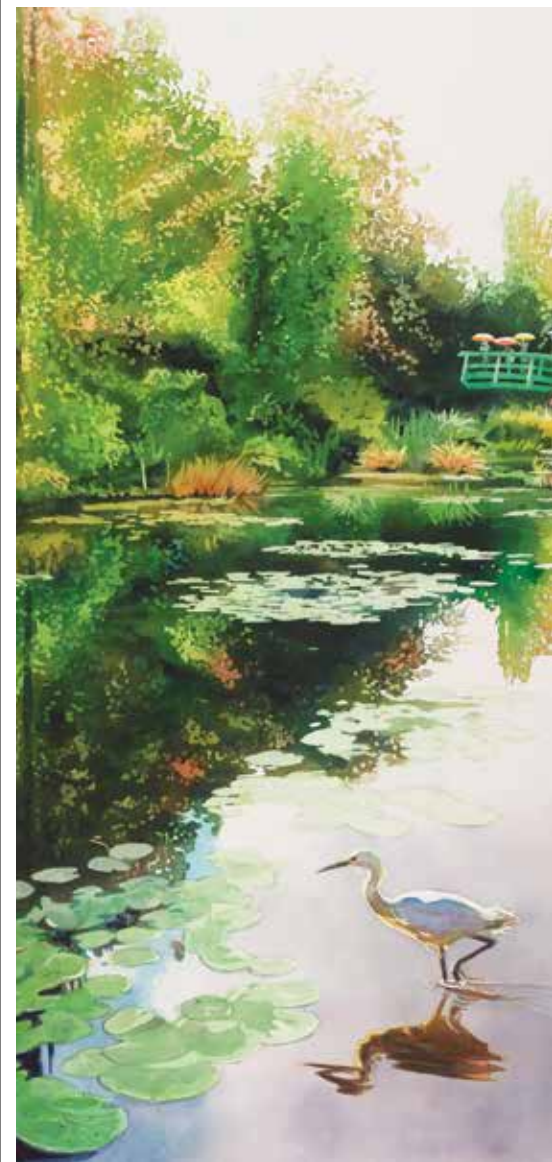
above: Visiting Artist Paul Jackson, Untitled , watercolor, detail