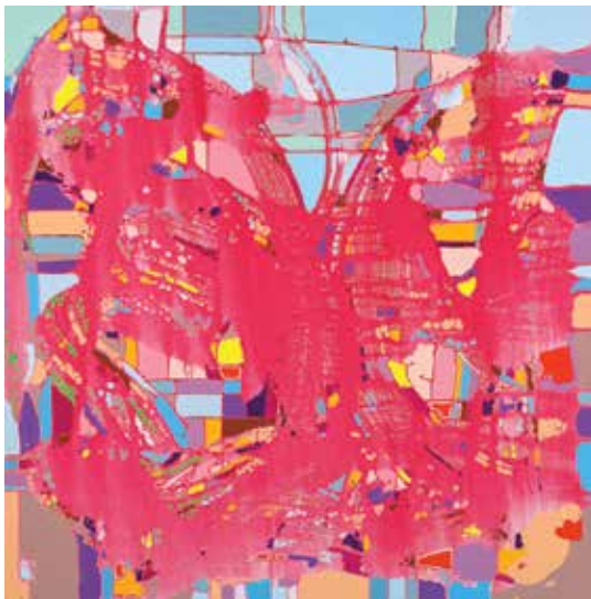
above: Jan Filarski, Light and Airy , acrylic ink and acrylic paint on canvas