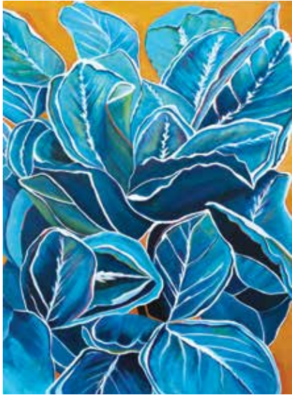
above: Susan Pennell, Petals , acrylic on canvas, detail

Wednesdays, September 14 – December 7 No Class October 5 & November 30 9:00 am – 12:00 pm, 11 sessions $305 Members, $345 Guests, $15 Materials Fee