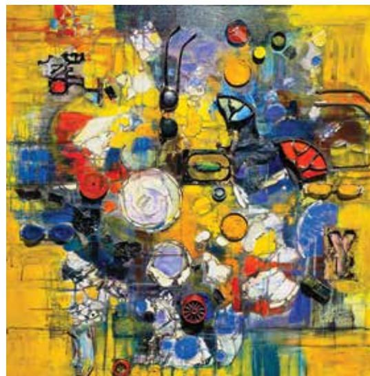
above: Veronica Schaden, My Room Has Many Windows , acrylic collage