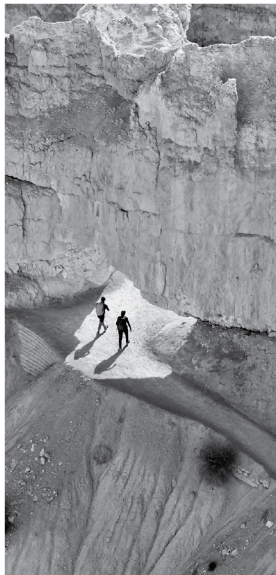
above: Instructor Steven Tapper, Untitled , digital photography, detail