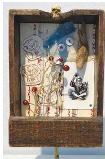
right: Anotnia Oakley, Protect What You Have , mixed media