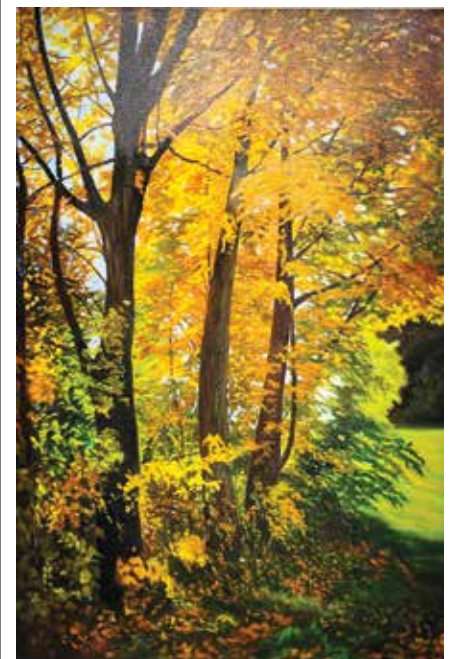
right: Valarie Root, Fall Splash , oil