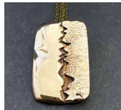
right: Gary Tolman, Bronze Canyon, bronze, detail