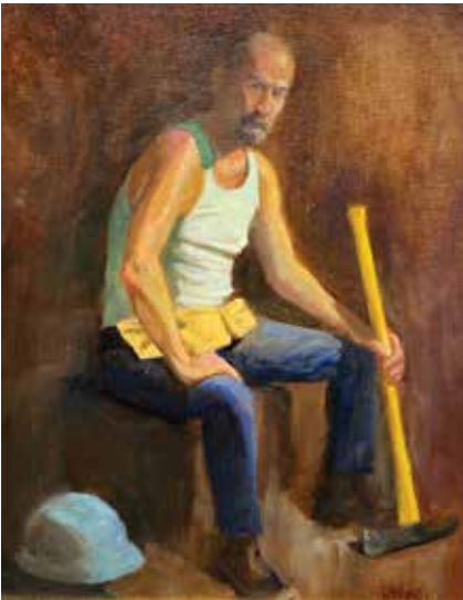
above: Helen Vlasic, Well Deserved Break , oil on linen, detail

$333 Members, $373 Guests, $132 Model Fee $5 Materials Fee