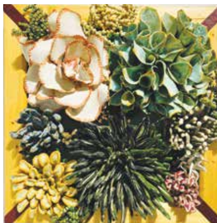
above: Mary Catalano, Succulent Wall , ceramic tile, detail