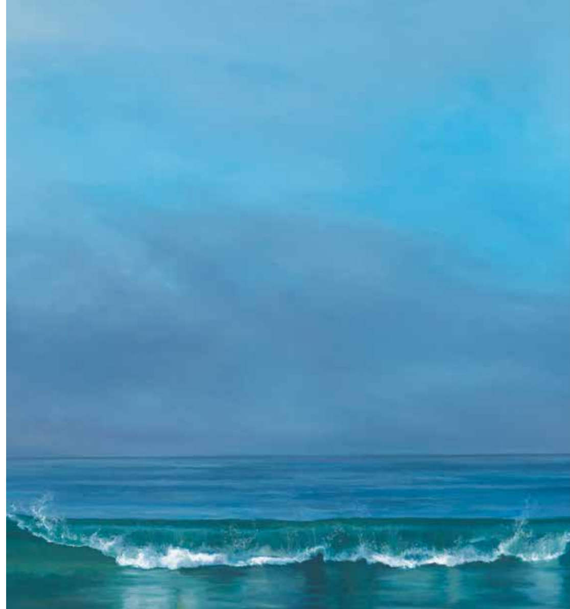
Edward Duff, Emerald Surf, oil, detail