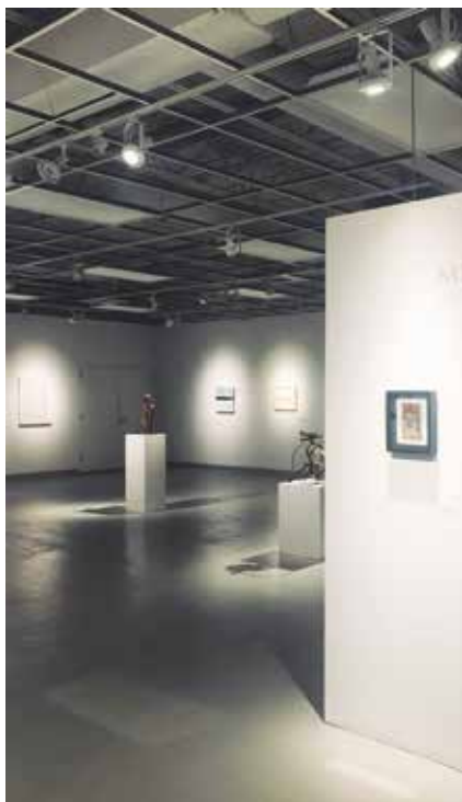
above: BBAC Robinson Gallery

*Number of participants is dependent on current COVID policies. Go to bbartcenter.org to find out more.