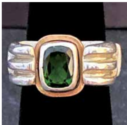
above: Isabel Von Loesecke, Spielring , sterling silver, detail