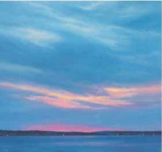
above: Instructor Edward Duff, Fade , oil, detail

Wednesdays, September 14 – October 19 9:00 am – 3:30 pm, 6 sessions $361 Members, $401 Guests, $5 Materials Fee