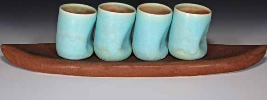
above: Lynn Tan, Coxless Four , porcelain on wood