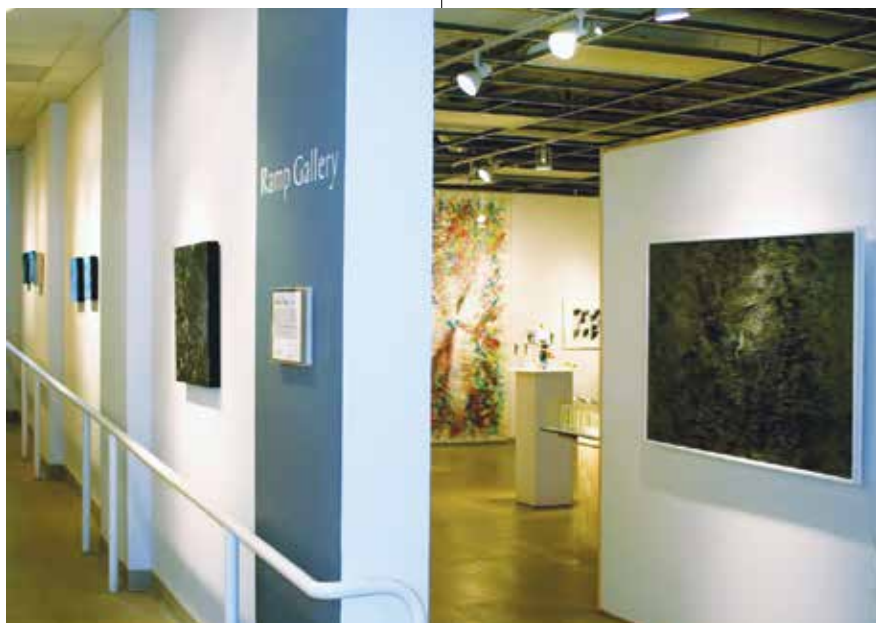
above: BBAC Ramp and Robinson Galleries