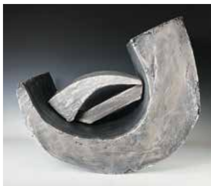
left: Instructor Darlene Earls, Sculpture 2 , cardboard, hydrostone & paint