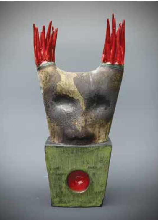
above: Instructor Lisa Farris, Red Spiked Creature , ceramic

One 25 lb. bag of clay is included with your class. BBAC offers the service of purchasing additional clay (one bag at a time) and can be purchased during class time.