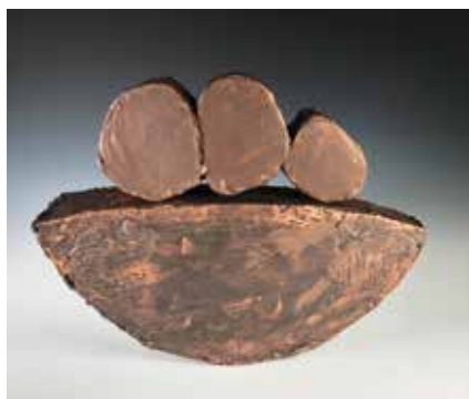
left: Instructor Darlene Earls, Sculpture 1 , cardboard, hydrostone & paint