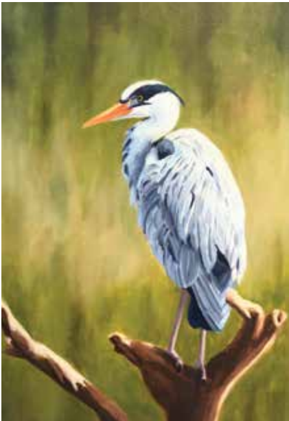
above: Kate Neville, Untitled , oil, detail