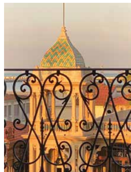
right: Instructor Laurie Tennent, Tuscany 2021 , photograph

Tuesdays, April 5 – May 24 7:00 pm – 9:00 pm, 8 sessions $160 Members, $200 Guests, $50 Materials Fee