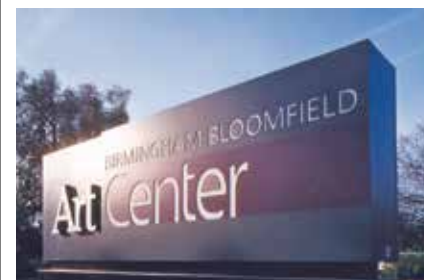
above: BBAC Sign