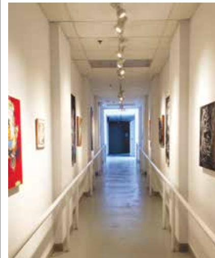
above: BBAC Ramp Gallery for Emerging Artists