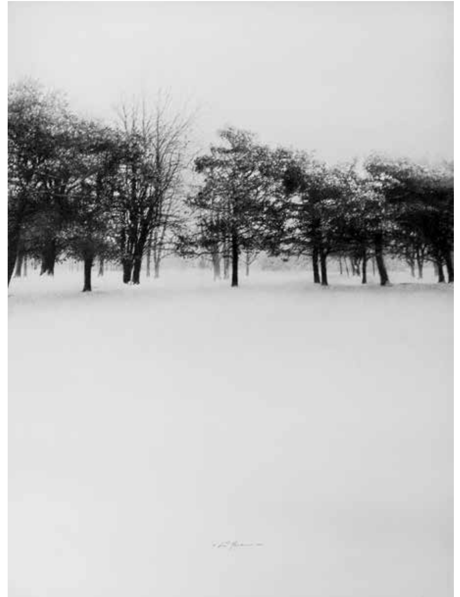
Instructor Armin Mersmann, Winter Still , graphite drawing, 40 x 30 inches