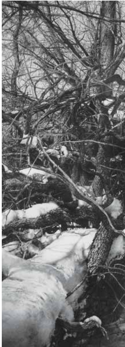
Instructor Armin Mersmann, Fractured Patterns , graphite drawing, 50 x 60 inches, detail

Monday–Friday, August 13 – 17 10:00 am– 4:00 pm, 5 sessions $398 Members, $438 Guests