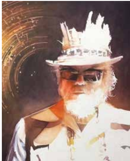
above: Paul Jackson, The Night Tripper , watercolor, detail