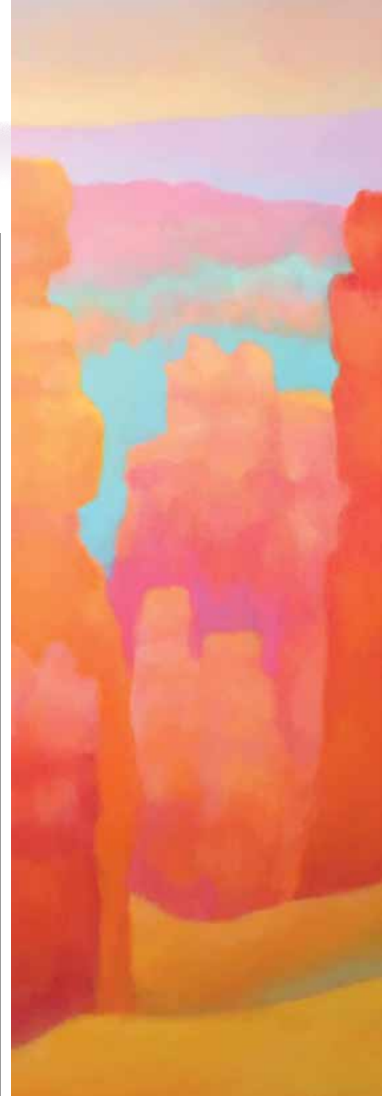
right: Leslie Masters, Bryce Canyon , acrylic, detail