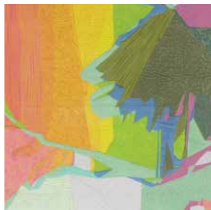
above: Gwyned Trefethen, Pansy Abstraction , fiber, detail