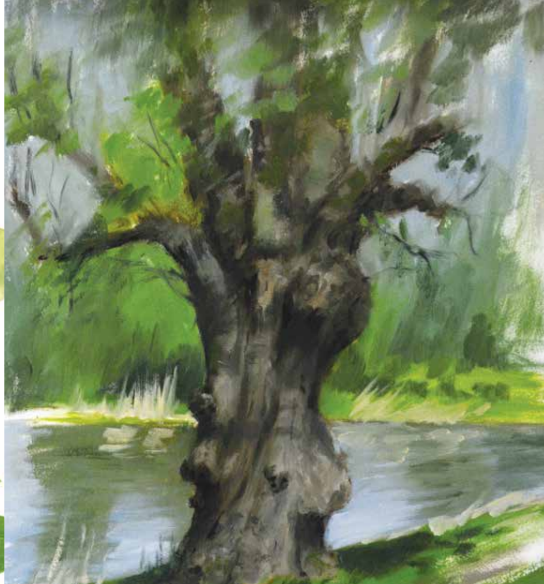
Brian Skol, An Old Willow , oil on paper, 12 x 16 inches, detail