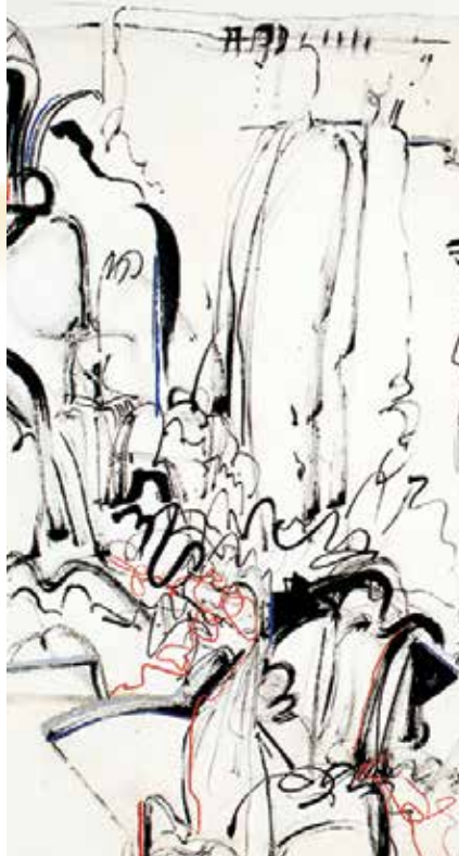
above: Instructor Meighen Jackson, Below the Falls , mixed media, detail