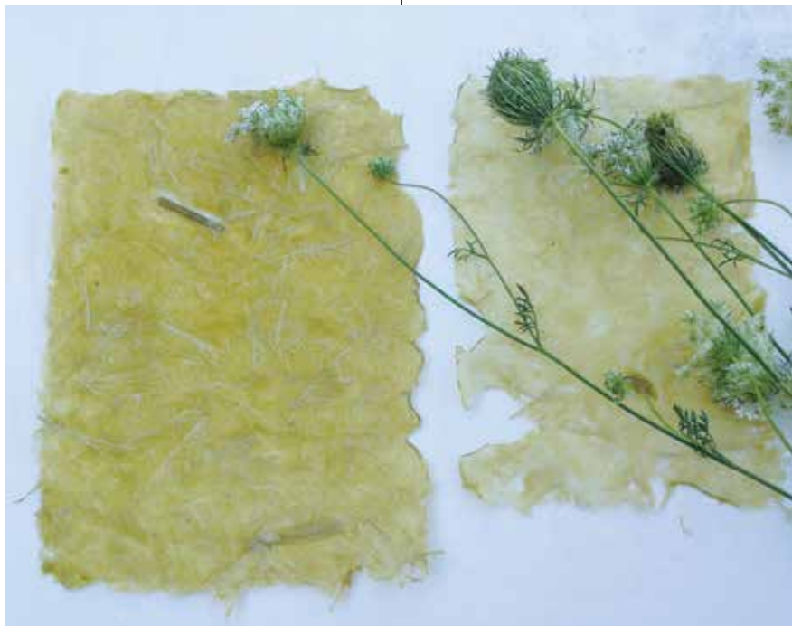
below: Megan Herees, Wild Carrot Paper