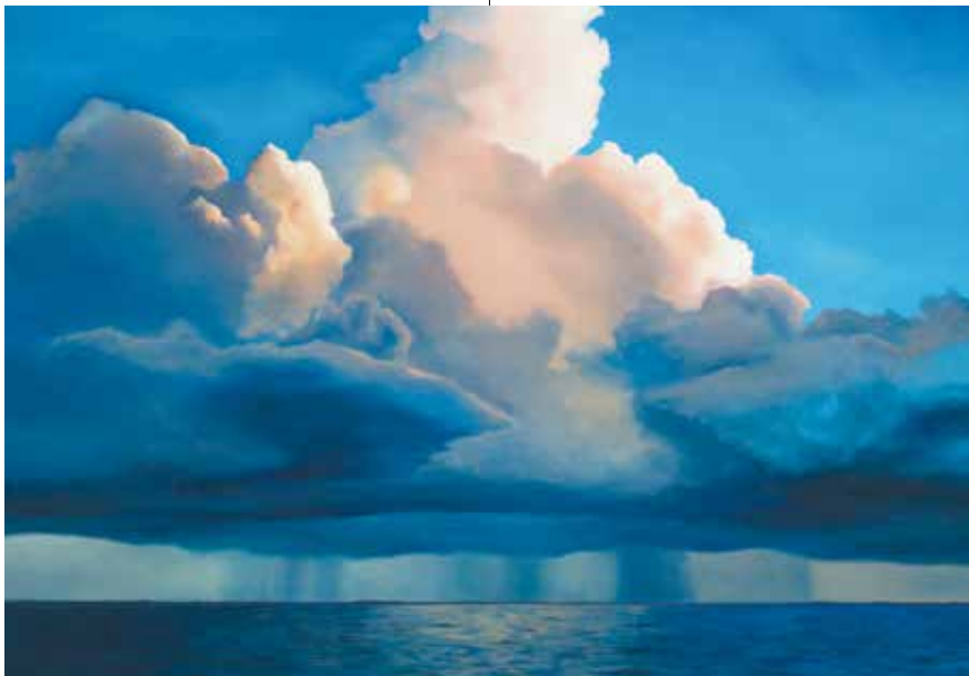
below: Instructor Edward Duff, Storm Over Sea #5 , 48 x 60 inches, oil on canvas, detail

$85 Members, $125 Guests, $5 Materials Fee