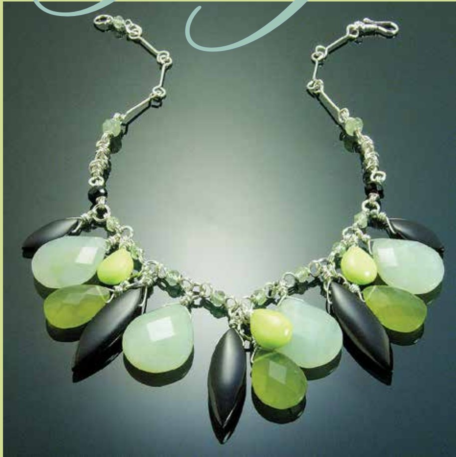
above: Carl Schneider, Beaded Necklace , hand-tooled silver & prehnite w/ black obsidian, faceted new jade, faceted olive quartz; variscite teardrops