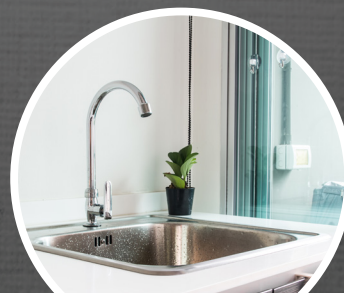
SINKS AND FAUCETS