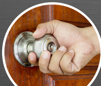
DOORKNOBS AND HANDLES