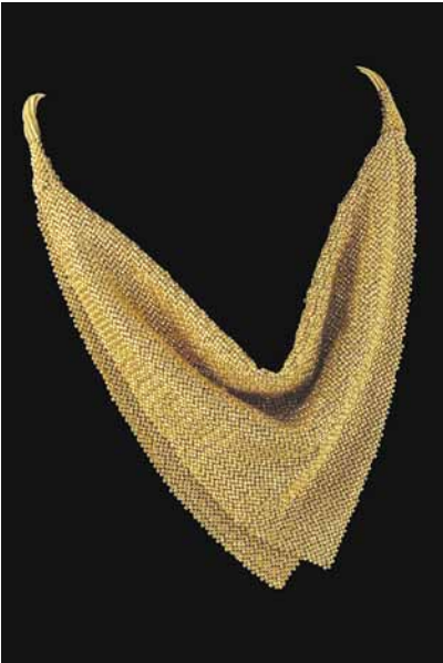
Gold Mesh Necklace, beads