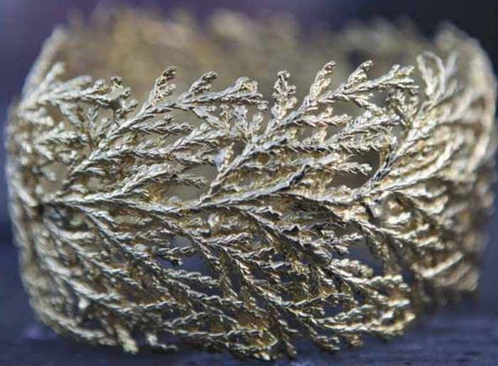
Thiya Branch Cuff by Selen Design