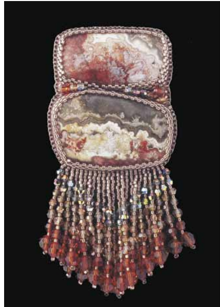
Brooch, cabochon and beads