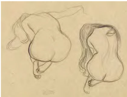
above: Gustav Klimt, Austrian—black chalk & red pencil, c. 1901-1902, 12-1/2" x 17-13/16"