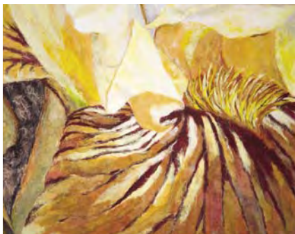
Iris, acrylic, detail