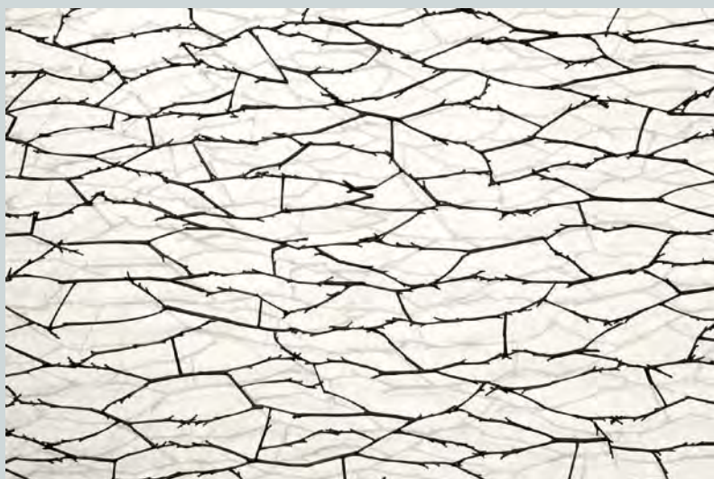
Larry Cressman, Ground Cover II , detail Constructed Drawing: Daylily stalks, graphite, polymer medium, glue, pins — 68" x 68" x 4" 2012