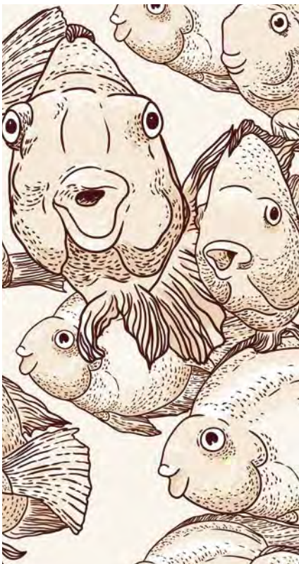
right: Woodblock Print, Fish , detail