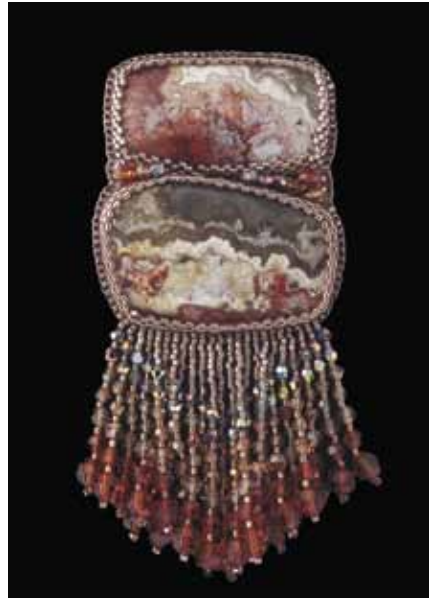
Brooch, cabochon and beads