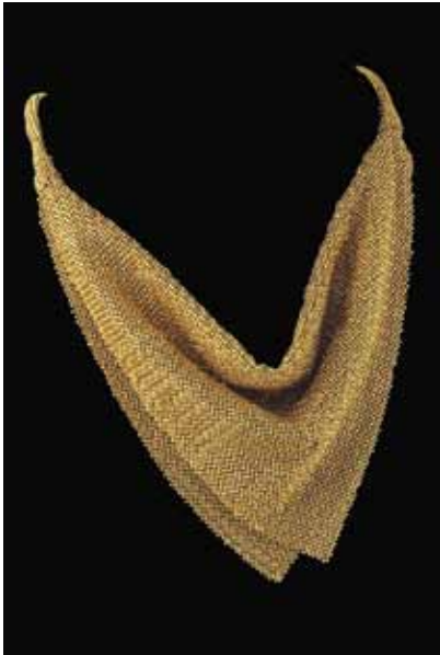
Gold Mesh Necklace, beads