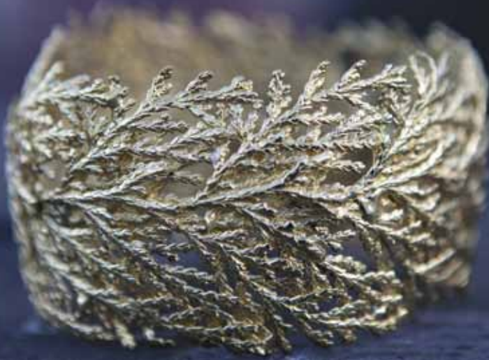
Thiya Branch Cuff by Selen Design